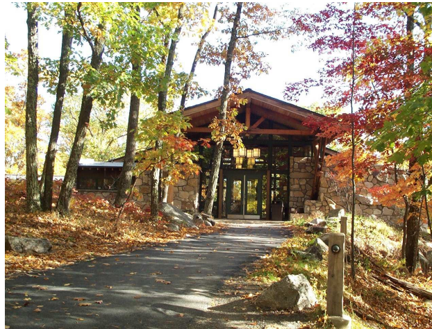
Mohonk Preserve Visitor Center on Route 44/55

Join us in our mission to protect the Shawangunk Mountains by becoming a Business Member today!